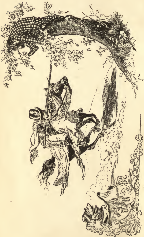
“ I SAW HE MEANT BUSINESS ”